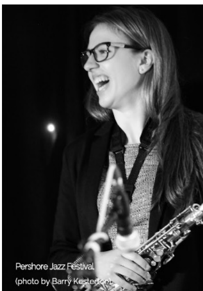
Pershore Jazz Festival

Saturday 21 st . August, doors open 7.30 p.m., show starts 8.00 p.m.