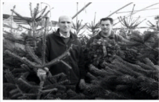
Christmas Trees Individually Hung