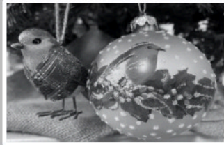
Decorations and Lights Dazzling Display