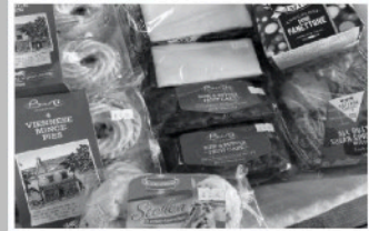
Food & Gifts Great Selection

Late Night Opening Wed 8 th Dec until 7pm – Father Christmas online booking